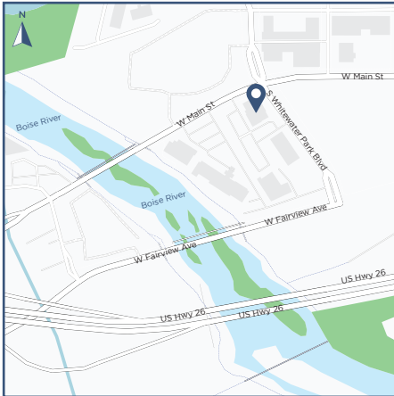
BOISE OFFICE 3003 W Main, Ste 130 Boise, ID 83702